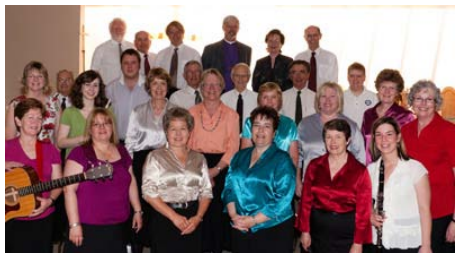
The Bishop's Gospel Choir of BC