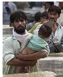
A man escaping floods in Risalpur, Pakistan.

The Primate's World Relief and Development Fund The Anglican Church of Canada 80 Hayden Street Toronto, Ontario M4Y 3G2